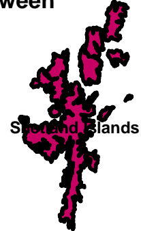
Figure 4b Percentage change in life expectancy at birth between 1993-95 and 2003-05, Council area, Females [Map]