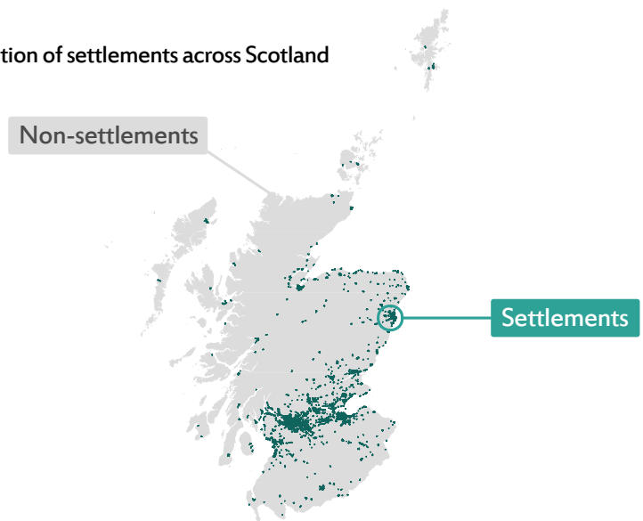
Distribution of settlements across Scotland